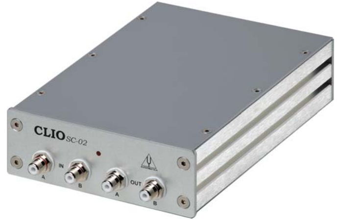
SIGNAL CONDITIONER SC-02